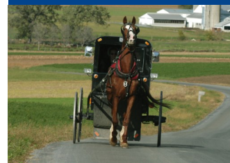
Experience the Amish lifestyle