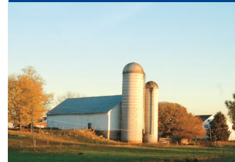
Enjoy the Picturesque Views of Lancaster

Day 3: After enjoying a Continental Breakfast, you'll enjoy a visit to the Flight 93 National Memorial in Stoystown, PA. Later, you'll depart for home. A perfect time to chat with your friends about all the fun things you've done, the great sights you've seen and where your next group trip will take you!