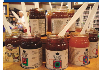
Visit to charming Kitchen Kettle Village