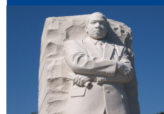
Martin Luther King, Jr. National Memorial