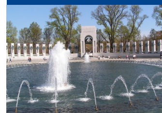
World War II Memorial